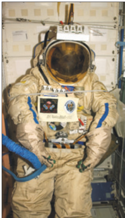
SuitSat-1 all dressed up for its flight into space.

ARISSat-1 is a unique Amateur Radio experiment and offers many new and exciting features. Among them, the on-board SDX system allows hams to speak with one another via satellite using CW and SSB. And unlike FM repeater satellites that can only support one conversation at a time, the